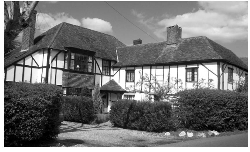
9 Cheney Street, Cheney Farmhouse, Grade II

The dominant features of the streetscape of the area are the hedges and low walls bordering front gardens, the mature trees, grass verges and the central reserve. These, together with the curving road layout and gentle topography, create an attractive street scene. The spacing between the houses, landscaping and views through to the back gardens all combine to form an attractive gateway to the Conservation Area.